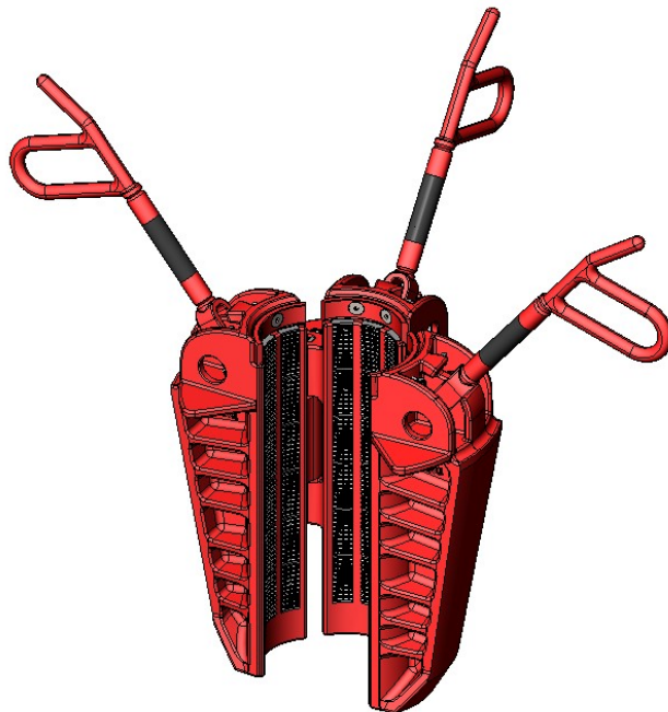
SDXL 5" SLIP BODY SHOWN

BVM CORPORATION 307 MAGNOLIA BUSINESS PARK DR. MAGNOLIA, TX 77354; PHONE: 346-296-5501 www.bvmcorp.com; sales@bvmcorp.com